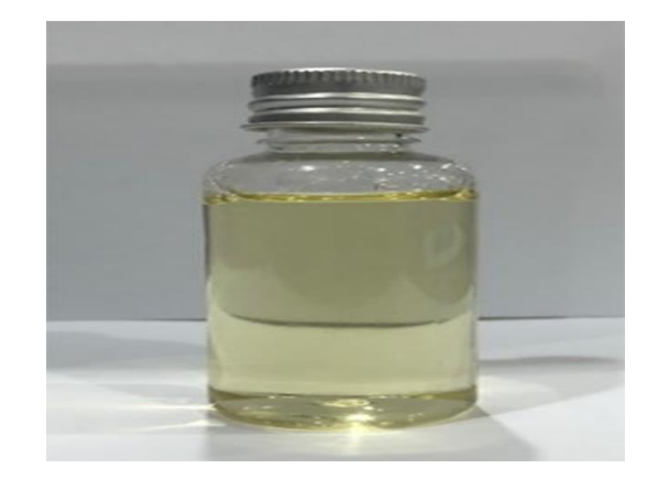
Figure 2 The appearance of the shower gel containing extracts.

© 2021 the authors. This work is licensed under the Creative Commons Attribution 4.0 International License